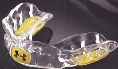
MOUTHGUARD FOR CONTACT SPORTS